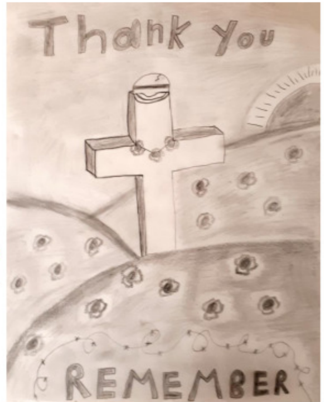
2nd Place Helena T. Branch - 496 Sydenham Zone G-1