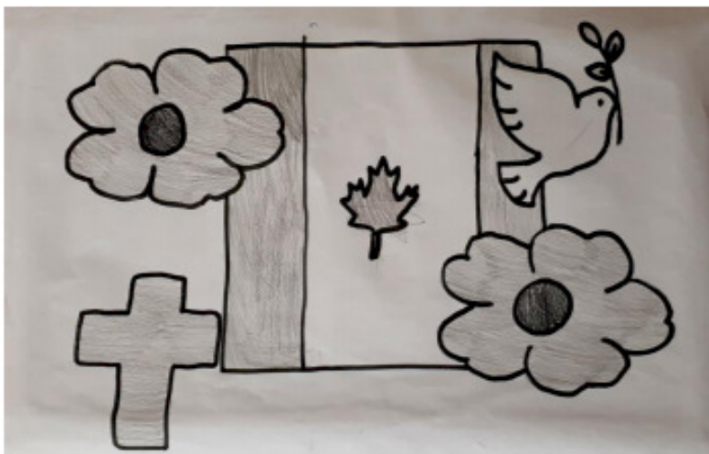
3rd Place June M. Branch 480 - Westboro Zone G-5